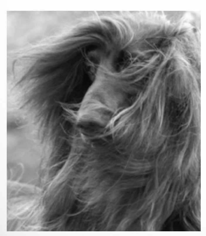
Photo 4 - Rashid Ebn Hugo Von Haussman at Myhalston after eating Canine Dermatosis DRM

"Canine Dermatosis DRM contains essential building blocks of collagen as it is rich in lysine, glycine, proline and arginine; It also contains other skin targeting nutrients such as zinc, vitamin A (the vitamin of the epithelium), B vitamins and anti-oxidants vitamins such as vitamin E and C."