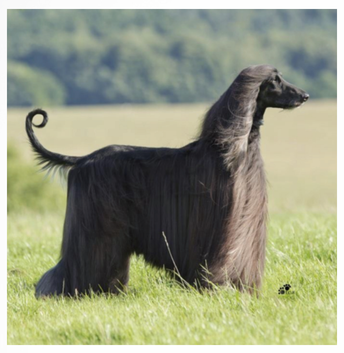
Photo 3 - Rashid Ebn Hugo Von Haussman at Myhalston after eating Canine Dermatosis DRM

Also not only did the diet help his coat, but his muscle condition too. Rashid is shown all over Europe and has to be in excellent body condition (Photo 3 & t 4).